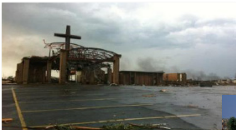
St. Mary's Church- Joplin, Missouri

No evil shall befall you, nor shall affliction come near your tent, for to His Angels God has given command about you, that they guard you in all your ways. Upon their hands they will bear you up, lest you dash your foot against a stone. Psalm 91: 10-12